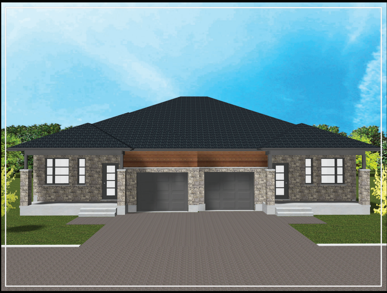
Artist Concept - Not to be used as an Official Document.